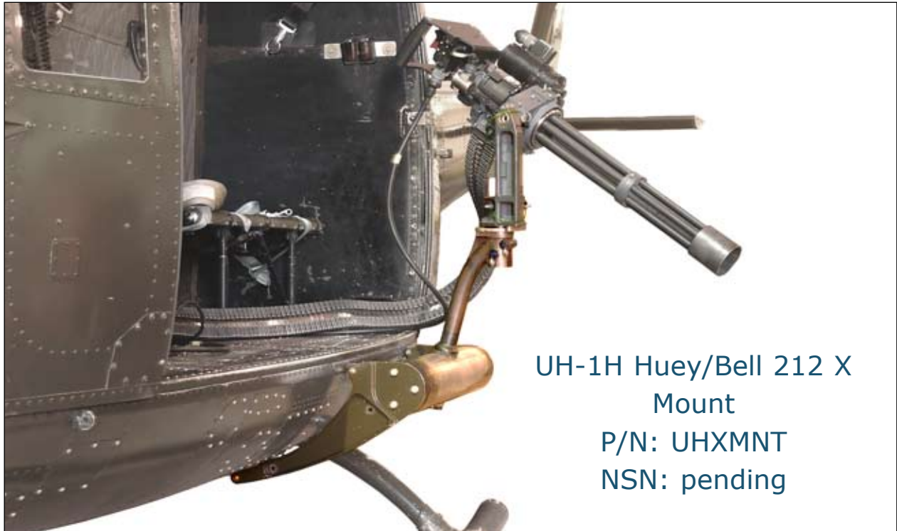
UH-1H Huey/Bell 212 X Mount P/N: UHXMNT NSN: pending

Dillon makes three External Beam Mounts for the UH-1 series utility helicopters. These simple, light weight "plug and play" designs allow for a variety of installation options depending on aircraft configuration. These mounts pick up factory installed hard points on the belly of the aircraft. They consist of two main support arms, cross beam, and between